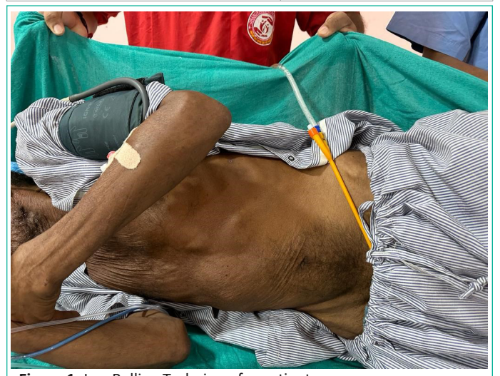
Figure 1: Log Rolling Technique for patient.

and any adverse effects e.g. nausea, vomiting, urinary retention, nasal congestion were noted.