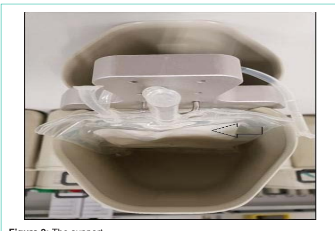
Figure 2: The support. A support (indicated by the arrow) was added to the centrifuge insert. This enabled the unit and its components to keep steady throughout the centrifugation process.

The Platelet Count per unit (x10^{11}/L) and Volume per 60x10^9 platelets (ml) of the final RP obtained from the four different methods, as well as the conventional pooling of platelets (using five BCs) performed at the NBTS, were statistically analyzed by the OneWay Analysis of Variance (ANOVA) test using the IBM SPSS Statistics 20 Software. Raw data has been summarized in Descriptive Data Tables 1 and 2. Tukey Post Hoc test was used to compare mean platelet counts and mean volume between several methods,