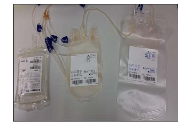
Figure 3: Deconstructed pooling kit.

An example of the deconstructed pooling kit utilized for Method II. The bag in the middle is the mother bag and is directly attached to the final pooling bag (on the right-hand side) without the filter in-between.