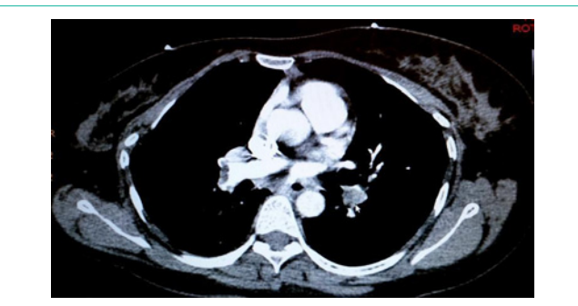
Figure 2: AXIAL CT PULMONARY ANGIOGRAM illustrating acute thrombus involvement in bilateral main branches of pulmonary trunk extending into the lobar and segmental branches.