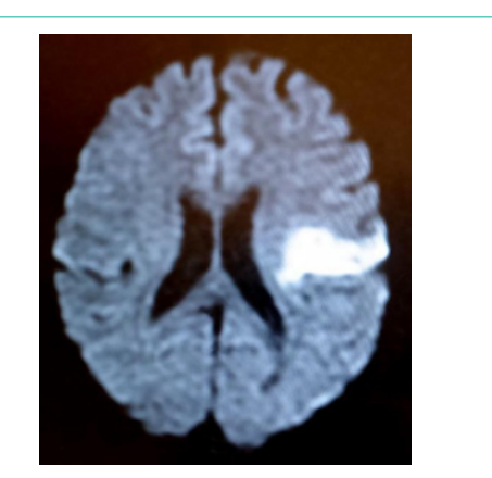
Figure 1: AXIAL MRI BRAIN DWI sequence showing restricted diffusion in the left inferior frontal gyrus.

She was started on heparin infusion at the rate of 500 units/hour along with supportive treatment as she was beyond the window period for alteplase infusion. Same day evening, she became tachypnoeic, tachycardic, and de-saturated to spo2 of 80%. Having explained clearly all life threatening risks, thrombolysis with Alteplase was decided upon. She was administered 100mg alteplase according to the standard protocol of pulmonary embolism at 9:25pm of 27<sup>th</sup> February, 2016. The procedure was well tolerated. Her hemodynamic status improved markedly. And above all, clinically there was reversal of aphasia with power in the right side improving to 4/5 of MRC grade.