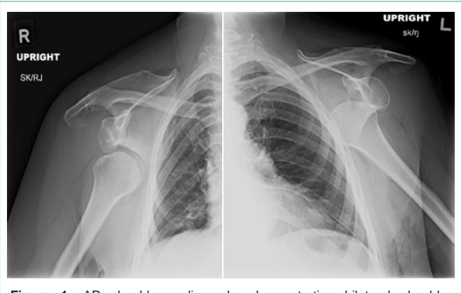
Figure 1: AP shoulder radiographs demonstrating bilateral shoulder dislocations.

Pain was controlled at rest. There was no evidence of joint laxity at any other joints on secondary survey to indicate a predisposition for dislocation, such as those with Ehler-Danlos Syndrome.