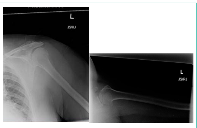
Figure 4: AP and axillary radiographs of left shoulder post-closed reduction.

We presented this case report due to the rarity of its occurrence. Our patient did not have any history of seizures or electrocution. There was also no evidence of joint laxity, such as those found in patients with Ehler-Danlos syndrome. Our patient also did not have any history of prior shoulder dislocations. There was also no associated fracture of either glenohumeral joint in this patient. Given these circumstances, we propose a unique case where the mechanical forces were simultaneously applied to the patient's arms while she braced