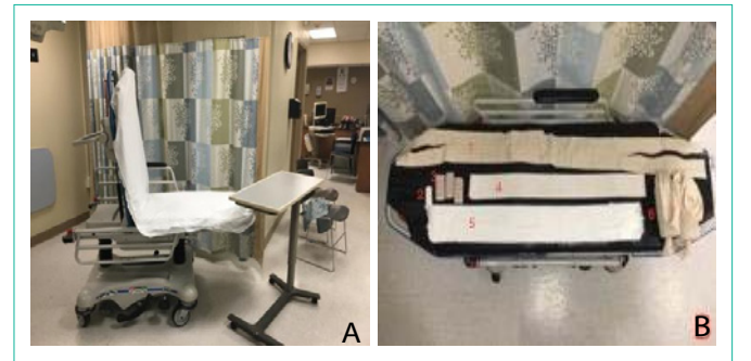
Figure 1: A: The stretcher allowing the simulated patient with an un-injured right arm to be seated and the rolling table. B: The supplies used for splinting: (1) six inch stockinette approximately the length of the patient, (2) one roll of cling gauze, (3) three four-inch ACE bandages, (4) four-inch plaster splinting material, (5) six-inch under cast padding and (6) weights (four one-liter saline bottles inside stockinette).

In addition to non-union, other indications for operative treatment include open fractures, segmental fractures, pathologic