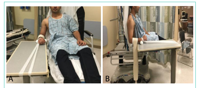
Figure 3: A & B : Two views demonstrating how a cinch loop can be placed over the wrist and secured on the post of the mayo stand, while the wrist is padded on the volar side with a roll of cast padding for patient comfort.

also insert onto the humeral shaft. The location of the fracture along the humeral shaft in relation to these sites of muscle attachment determines the deformity seen in HSFs. Fractures distal to the deltoid insertion will have the proximal fragment abducted by the pull of the deltoid, while the distal fragment is pulled medially by the triceps and biceps. In contrast, fractures proximal to the deltoid insertion will have the proximal fragment adducted by the pull of the pectoralis major and latissimus dorsi.