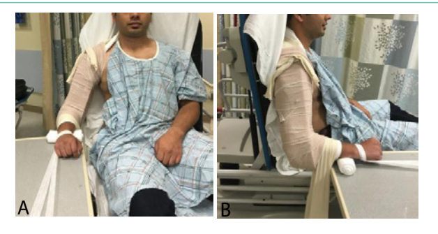
Figure 6: A & B: Two views of the patient after application of ace wrap around the splint. Note exposure of the knot from the axilla so that it can be cut off when splint has hardened.

While the brachium remains in traction, the coaptation splint is wrapped snugly with the ACE bandage (Figures 6A, 6B). Keeping the knot from the medial limb exposed while the ace wrap is placed keeps the splint high in the axilla and serves as a reminder to cut the