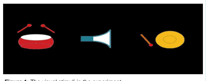
Figure 1: The visual stimuli in the experiment.

This study used visual and auditory stimuli. Three visual stimuli were presented in Figure 1. The frequency spectrums of auditory stimuli were presented in Figure 2. Each visual stimulus had a corresponding auditory stimulus. Stimulus Onset Asynchrony (SOA) was 600ms. The presentation of each stimulus lasted 400ms. The volume of auditory stimuli was unified.