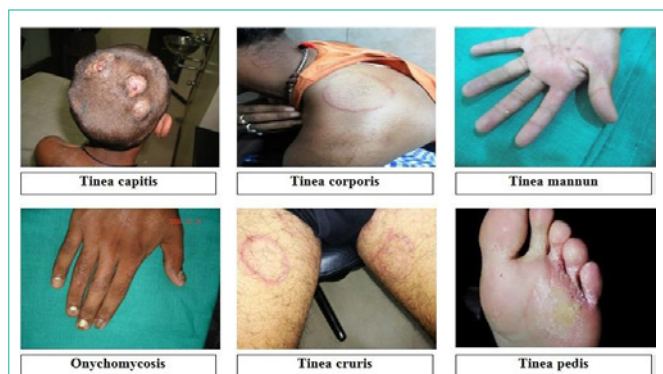
Figure 1: Different sites of superficial fungal infections in patients with ESRD.

Values expressed in mean ± SD. Kt/V parameter used for measurement of the adequacy of haemodialysis treatment.