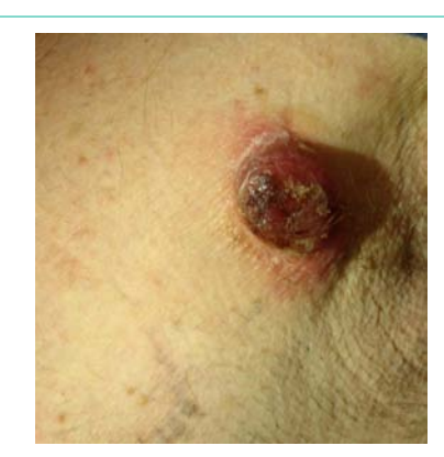
Figure 1: Asymptomatic nodule (2cm x3cm) in the left pectoral area. The lesion was not painful, not malodorous and firm on palpation. The surrounding skin was erythematous.

According to the histopathological and clinical features a diagnosis of cutaneous anaplastic large cells lymphoma (CALCL) CD30 positive and ALK positive was made. Consequently, an osteomedullary biopsy (OMB) was performed, showing a hematopoietic bone-marrow cellularity of 25% (CD20 + B lymphocytes 5% and CD3+ T lymphocytes 7% with interstitial random distribution) in the absence of localization of lymphoma. The total body CT and the laboratory investigations were also negative.