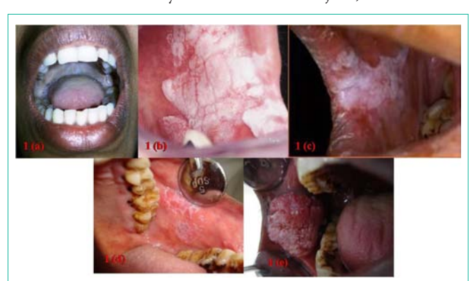
Figure 1a-e: Different oral pre-cancerous lesions and conditions included in the study:

The study was conducted in Department of Oral Medicine and Radiology. The patients were selected from those attending OPD of Department of Oral Medicine and Radiology during the period of May 2013-May 2014. The protocol of the study was approved by Institutional Ethics Committee. A total 27 subjects (Figure 1a-e) were studied including 10 cases each of oral submucous fibrosis and hyperkeratotic lesions including homogeneous and non-homogeneous leukoplakias, 6 cases of oral lichen planus and a case of clinically suspected oral squamous cell carcinoma. The significance of the number of samples was analyzed statistically before their inclusion into the study. For each of the subjects, a detailed case