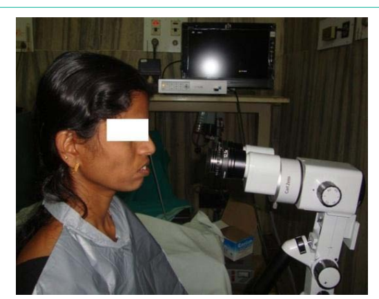
Figure 2: Patient positioning for Colposcopic examination.

history and thorough clinical examination was carried out and under good illumination, intra-oral examination of the lesion was performed. Inspection and palpatory findings were recorded in a prepared proforma. Following clinical and followed by colposcopic examination (Figure 2) of the lesions, the most representative site of the lesions were selected for biopsy. When the area selected for biopsy by clinical criteria and colposcopic examination was superimposed, then only one common biopsy sample was obtained. When two different areas were selected from the same lesion, two different areas which were marked with different colors were biopsied and subjected to histopathological examination. Comparison of the histopathological diagnosis obtained with routine clinical examination and direct intra-oral microscopy was performed, and the data was subjected to statistical analysis.