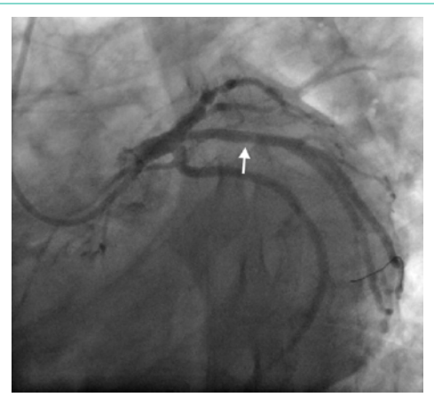
Figure 3: Coronary Angiogram: Successful Revascularization of Left Anterior Descending Artery lesions and establishing TIMI grade 3 flows.

Platelet therapy (DAPT) with Aspirin 325mg PO and Plavix 300mg PO was empirically administered. Interestingly, the platelet count was reported at more than 2million/mm³ and leukocytosis was noted. Hematology- oncology service at the OSH recommended against the use of intravenous (IV) thrombolytic therapy given high probability of a bleeding diathesis in the setting of excess number of abnormal platelets. Patient was administered a single dose of Hydroxyurea 500mg PO and was transferred to a tertiary care facility to undergo platelet-pharesis and further management of possible ACS.