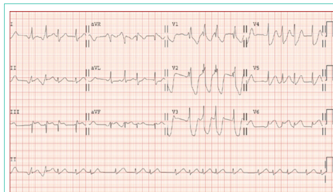
Figure 1: The ECG shows atrial fibrillation, right bundle branch block and a pattern of circumflex artery occlusion: ST, measured at 60 m sec from j point, isoelectric in lead I, ST elevated 1 mm from baseline in leads II and III and marked depression of ST in V1-V3 leads.

We think that some of the ECG signs are pathognomonic for LCx injury. From our experience [6,7] the following electrocardiographic criteria are useful in the diagnosis of right coronary artery versus LCx occlusion when included in a 3-step algorithm: (a) ST changes in lead I, (b) the ratio of ST elevation in lead III to that in lead II, and (c) the ratio of the sum of ST depression in precordial leads to the sum of ST elevation in inferior. Therefore, neither the first step, ST isoelectric in lead I, nor the second step, ST-segment elevated 1 mm in II and III leads is conclusive, but the third step, ST-depression in V1-V3 higher than ST-segment elevation in inferior leads, is a diagnosis of LCx occlusion. Thus, the observer might think that they have accidentally ligated the circumflex artery on closing the left atrial appendage [8], as this is the normal technique to prevent the formation of clots and peripheral embolism. Nevertheless, to our knowledge, acute myocardial infarction due to the ligation of left atrial appendage has never been described. On the other hand, injury to the LCx during mitral valve surgery is a recognized complication, because the LCx