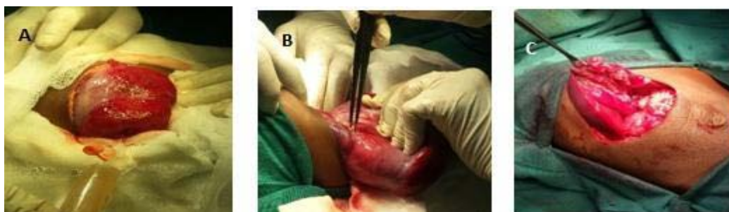
Figure 2: The cyst with the yellowish aspiration. B. Dissection and the resection plain. C. Cyst bed after resection and hemostasis.