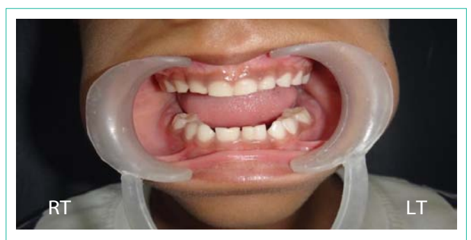
Figure A: Intra oral photograph of the patient showing fused 71, 72 and 81, 82.

An Intra Oral Periapical Radiograph (IOPA) was advised. Radiographic evaluation of the IOPA revealed fused 71-72; and 81-82 with two crowns and two roots fused together and two separate root canals, one in each of the fused teeth indicating that the fusion was of incomplete type. Absence of a single incisor was also observed on the radiograph (Figure B). To confirm the findings and to detect any other abnormality an Orthopantomograph (OPG) was advised. The