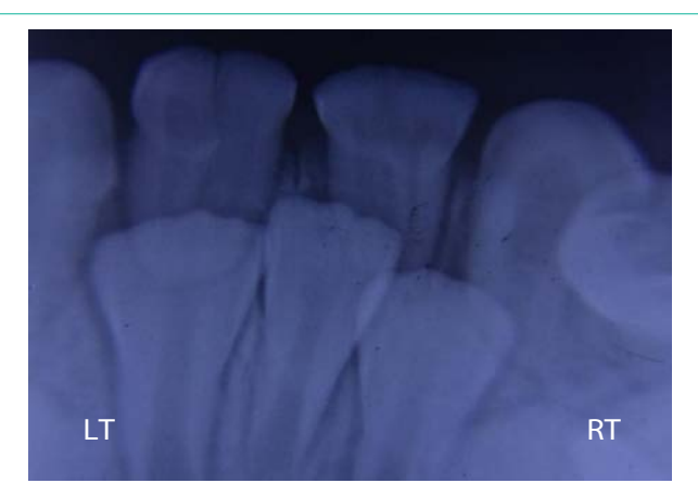
Figure B: IOPA radiograph showing fused 71, 72 and 81, 82 and absence of left permanent central incisor.

OPG confirmed the same findings (Figure C). It was very difficult to confirm whether the central incisor present in the middle was left or right at this stage as the three incisors were closely situated and were still within the bone. A thorough examination of the IOPA revealed that the middle incisor was right and the left incisor was missing. It was confirmed from the following ways 1. Morphology of the mamelons and crown found in the middle was much more like that of right mandibular permanent central incisor 2. This central incisor was present on the right side of the midline (Figure B) and 3. The path of eruption of the tooth present resembled more closely to that of right mandibular permanent central incisor. Hence, the patient was diagnosed to be a case of bilaterally fused mandibular primary central and lateral incisors of incomplete type with congenital absence of left permanent mandibular central incisor.