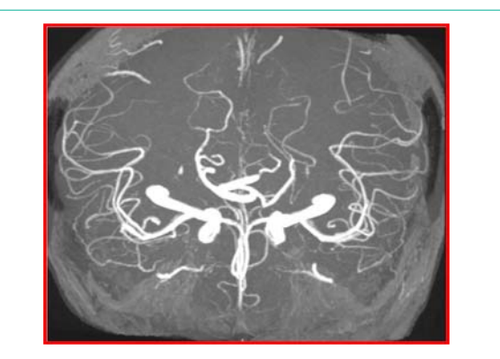
Figure 4: 3 month's follow-up non invasive angiography show complete resolution of the previous segmental vasoconstriction.

The following day a thunderclap type headache recurred acutely with pulsating severe occipital pain and mild neck stiffness. To rule out a SAH, a new cerebral CT was performed showing SAH in the basal cisterns with diffuse cerebral swelling. MRI with venous sequences confirmed SAH and excluded cerebral sinuses thrombosis (Figure 1). Non invasive angiography (MR angiography) and invasive angiography demonstrated a wide segmental vasoconstriction of the cerebral arteries with dilatations of the post-stenotic segments ("string of beads" appearance), without aneurysms or other vascular malformations (Figure 2,3).