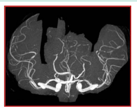
Figure 2: Non invasive and invasive angiography show a wide segmental vasoconstriction of the cerebral arteries with dilatations of the post-stenotic segments ("string of beads" appearance), without aneurysms or other vascular malformations.