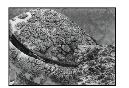
Figure 3: Example of a voice prosthesis covered with biofilm causing a malfunction in the valve mechanism.