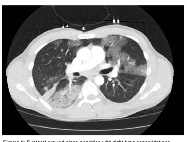
Figure 2: Bilateral ground glass opacities with right lung consolidations.