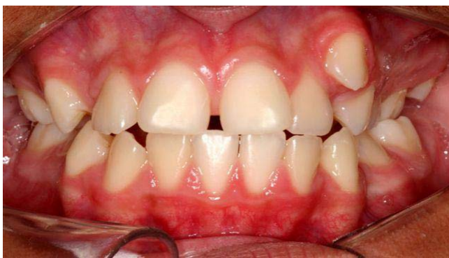
Figure 3: MST after surgery.

In the prior literature, MST were presented mainly in the maxilla with slight predilection for man gender, however in this case, the major number of supernumerary teeth were presented in the mandible of a girl (9) and only five in the maxilla [1-3,5].