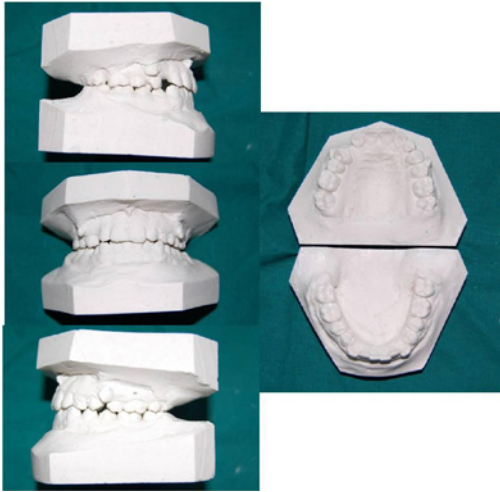
Figure 2: Dental Casts.