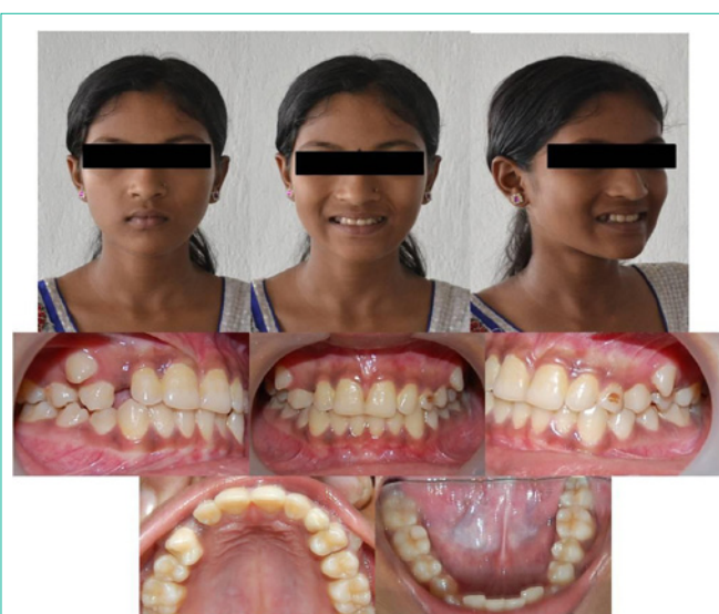
Figure 1: Extra oral and intra oral photos.

The maxillary canine is most frequently involved in transpositions. The term complete transposition is used when both crown and root