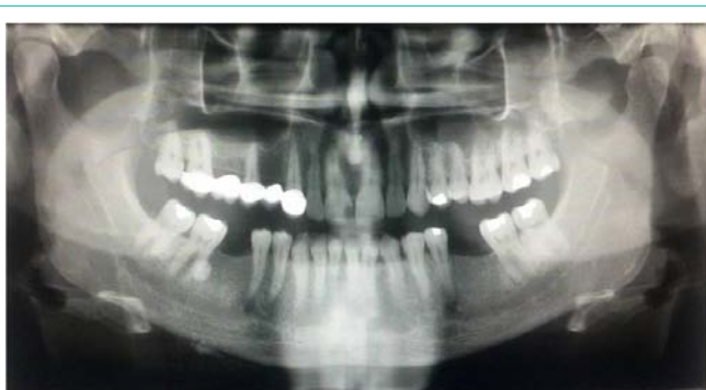
Figure 3: Panoramic radiograph depicting the multiple radio-opacities along the periosteal surface.