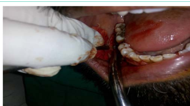
Figure 4: Surgical exploration of the foreign bodies.