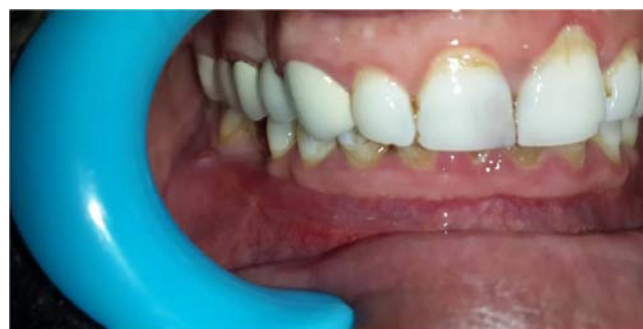
Figure 1: Intraoral swelling with sinus formation.

apparently normal 6 months back after which he met with an accident and suffered trauma to the right side of the lower jaw. He was treated by a local practitioner, who placed sutures on the right angle of the mandible. Two months back he noticed pus discharge in the same region. Pain is sudden in onset, sharp and radiating to the ear of the same side. No sign of fever or dysphasia is present. He also complains of altered sensation of the lower lip since 2-3 months which affected his daily activities. His medical history was non contributory. On extraoral examination, there was dysesthesia of the right side of the lower lip. On intraoral examination a solitary, erythematous, well defined, oval swelling is seen extending from mesial surface of the 46 to the mesial surface of lower right second molar. It is non tender and hard in consistency. A draining sinus is also present in the buccal vestibule of 47 (Figure 1). Right sub mandibular lymph nodes were palpable, soft in consistency and mobile A provisional diagnosis