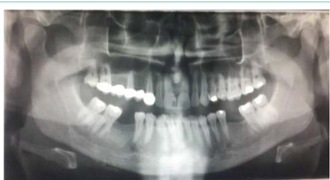
Figure 6: Post-operative Panoramic radiograph after removal of the stones.

foreign body reaction. The patient was recalled after 1 week and post operative radiograph was taken (Figure 6). The patient is presently under observation.