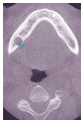
Figure 3: Cone beam CT scan axial view illustrating the lingual osseous concavity (arrow head) characteristic of Stafne's bone cavity.