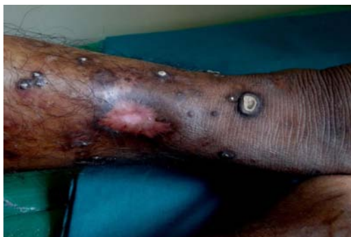
Figure 1: Multiple umbilicated papules and plaques with white-yellow crust affecting lower legs.

Reactive perforating collagenosis is characterized by umbilicated plaques with crust [1]. Dermoscopic patterns of RPC are described as yellowish-white structureless area in the centre surrounded by grayish rim [2]. Dermoscopy is a new diagnostic tool which allows visualization of surface as well as subsurface structures and it can be used in the diagnosis of acquired perforating dermatoses [3]. Here, new dermoscopic patterns of RPC are described. A 55 year old