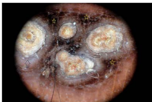
Figure 2: Dermoscopy demonstrates yellowish-white structureless area (red stars), grayish rim (black arrows) and peripheral blackish halo (yellow stars).