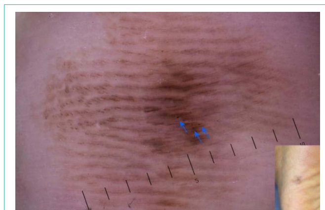
Figure 1: A fibrillar pattern with irregular black dots in the center (arrows) and a parallel ridge pattern in the periphery were detected in dermoscopy.