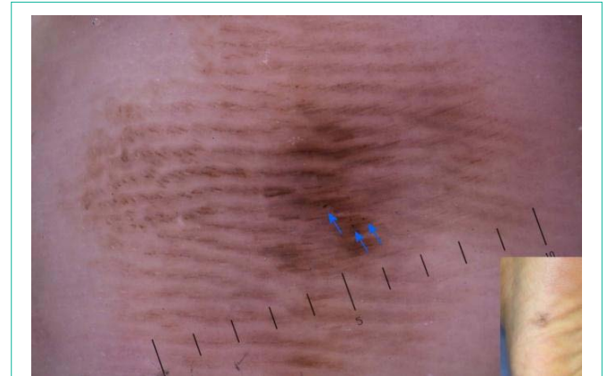
Figure 1: A fibrillar pattern with irregular black dots in the center (arrows) and a parallel ridge pattern in the periphery were detected in dermoscopy.