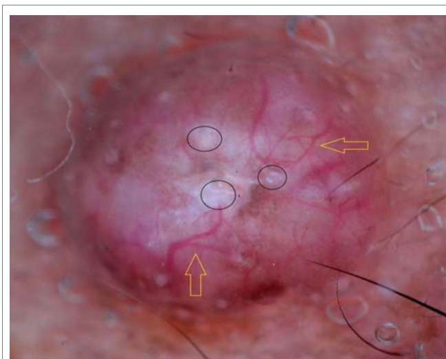
Figure 2: Dermoscopy shows polylobular white structureless areas (black circles) in the centre and serpiginous telangiectasias (yellow arrows) at the periphery.