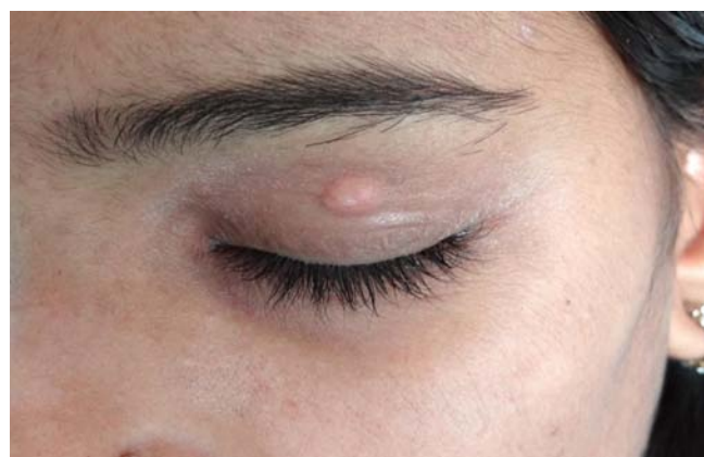
Figure 1: Single umbilicated skin colored nodule on the left upper eyelid.

Molluscum Contagiosum (MC) is a viral infection of the epidermal keratinocytes that results in a skin lesion with characteristic intracytoplasmic inclusions caused by pox virus. This common disease is confined to the skin and mucous membranes and produces benign, self limited, multiple umbilicated papular eruptions [1]. Although MC can be diagnosed easily, some factors such as lack of central umbilication, associations with other types of dermatological lesions, atypical lesions, small, single, initial lesions, inflammatory lesions and lesions with perilesional eczema may hamper diagnosis of MC [2]. Therefore, there is a need for early and easy diagnosis of MC. Dermoscopy serves best as a rapid diagnostic aide in such situations. It is a non-invasive diagnostic tool which visualizes subtle clinical patterns of skin lesions and subsurface skin structures that are normally invisible to the naked eyes [3]. A 25 year female presented with asymptomatic, slow growing, skin colored solitary swelling over left upper eyelid since 2 months (Figure 1). There was no history of trauma. Differential diagnosis of sebaceous cyst, inflamed milia, giant MC, nodular basal cell carcinoma and trichilemmoma was made. Dermoscopy showed polylobular whitish structureless areas in the