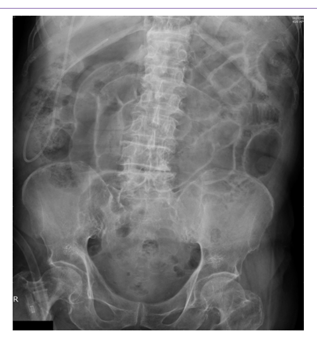
Figure1: Radiography of the abdomen revealed Rigler's sign, which indicated the visibility of bowel wall outlined by intraluminal and extraluminal air (white arrows)

Radiography of the abdomen showed Rigler's sign which is defined as the visibility of bowel wall outlined by intraluminal and extra luminal air and indicates pneumoperitoneum. Computed tomography of abdomen confirmed the diagnosis of pneumoperitoneum (Figure 2). Emergent explorative laparotomy