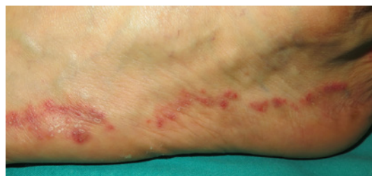
Figure 1: Multiple erythematous millimetric papules can be appreciated on the external part of the left foot, some of them converging forming plaques.

modified. The classical border would be blurred and the erythema as well as other signs of inflammation would disappear, misleading both the patient and the physician into thinking that the problem is solved. However, the local immunosuppression caused by this treatment help the fungi to proliferate, worsening the situation after the discontinuation of it, because it is likely that all the symptoms reappear beyond the borders of the original plaque. Corticosteroids have been made responsible for the majority of the cases of tinea incognito , but there have been several reports in which calcineurin inhibitors were involved [5].