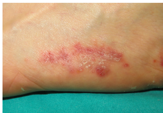
Figure 2: At higher magnification, the plaques show minimum scaling on the surface and minute pustules on their periphery.