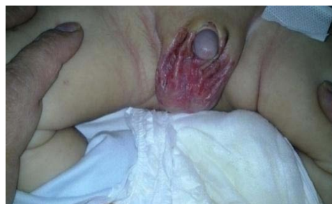
Figure 2: Papules and erythema on genitalia.

HSV Antigen 1 and 2 test of the lesion, and VDRL test were negative. Erythrocyte sediment rate was 15mm/hour and white blood cells were 12200/milliliter, with lymphocyte predominance.