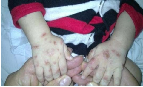
Figure 3: Popular lesions on the back of his hands.