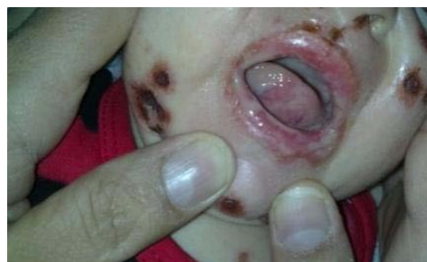
Figure 1: Facial lesions with a well-defined edge, hemorrhagic base and necrotic center.

In the previous medical visits, he had received cephalexin, with the impression of impetigo, without any improvement. Tzanksmear,