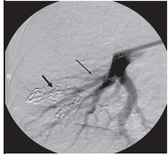
Figure 3: Following embolization with balloon (light black arrow) and recoiling (heavy black arrow), there is no evidence of arteriovenous malformations.

room air). The patient's platypnea and orthodeoxia resolved and she was discharged home. She had an uneventful vaginal delivery 5 weeks after the coiling procedure.