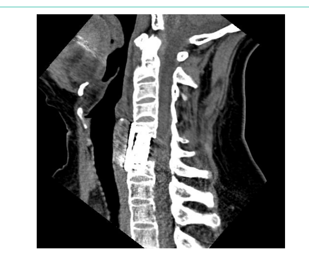
Figure 2: Internal instrument fixation over C5-7 with titanium mesh cage fusion.

identification of stable fractures is substantial in avoiding adverse neurologic outcome result from spine fracture [5]. Computed tomography (CT) may be the first choice with a shorter scanning time, and it can show bonydetails, including fractures and fragments. MR imaging can be much helpful in some patients with diagnostic limitation.<sup>6</sup>Prompt imaging studies of CT or MRI should be arranged to establish the diagnosis if needed.