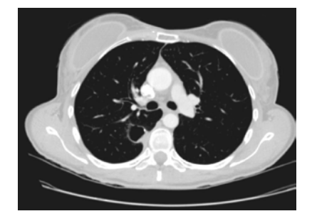
Figure 2: Computed tomography (CT) scan of the thorax with contrast depicting right posterior mid-lung thin-walled cavitary lesion with post-operative changes.