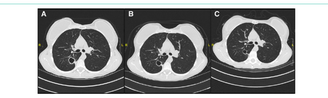
Figure 3A-C: Computed tomography (CT) scan of the thorax before and after treatment with posaconazole therapy.

With the increasing prevalence, chronicity of coccidioidomycosis, and a broad spectrum of clinical presentations, effective antifungal treatment is often necessary. The incidence of pulmonary coccidioidomycosis in endemic areas has substantially increased over the past decade. This trend has been reported beyond the traditional endemic areas of Arizona and California, due to a highly mobile society [13,14]. Azole antifungal therapy is the optimal choice in most patients, but relapse of infection is not uncommon.