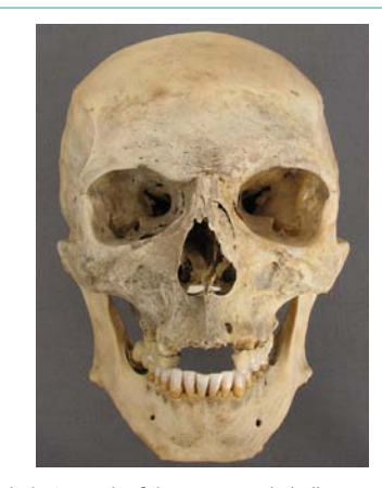
Figure 4: Frontal photograph of the recovered skull.

(bridge) with a cantilever (Figure 2). In the antemortem photograph taken a few years prior to the victim's death, tooth 23 appears to be heavily decayed and probably only its root was present (Figure 3). The extent of the lesion had most likely led to the extraction of tooth 23 and the re-establishment of the area with a dental bridge.