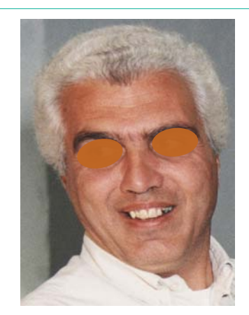
Figure 3: Antemortem photograph of the victim showing the lingual positioning of tooth 12 and the heavily decayed tooth 23.