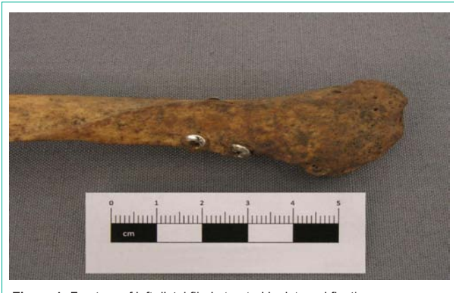
Figure 1: Fracture of left distal fibula treated by internal fixation.

The anthropological analysis revealed that the remains originated from a 35-55 year old Caucasian male, with a living stature of approximately 180-186 cm. The morphological assessment of the pelvis and skull indicated that the remains belonged to a male. The age was based upon the morphology of the pubic symphysis, the