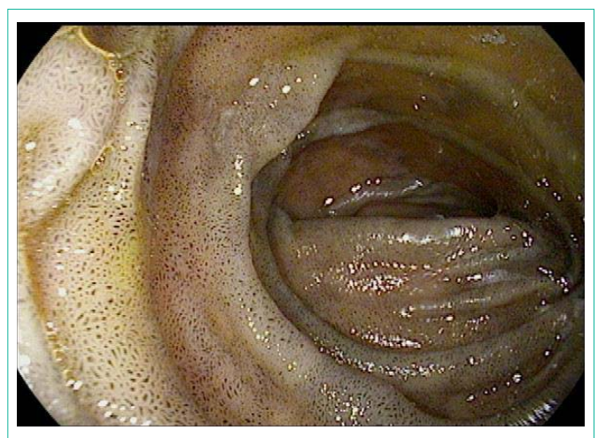
Figure 1: Speckled brown areas of hyperpigmentation in the proximal duodenum.