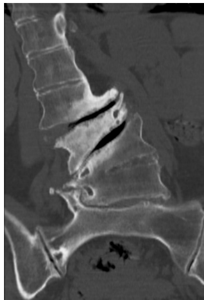
Figure 2: CT imaging of the thoracolumbar spine showing the severe degree of osteophyte buildup along the convexity of the deformity leading to high-grade foraminal stenosis.

Our first patient presented with severe axial low back pain and right lower extremity radiculopathy without any lower extremity weakness. Radiographs and CT imaging of the lumbar spine (Figure 1), (Figure 2) revealed severe degenerative disease with massive osteophyte buildup leaving the patient with severe right foraminal stenosis at multiple lumbar levels. The patient was taken to the operating room for LTIF at the L2-3 and L3-4 levels. Preoperative