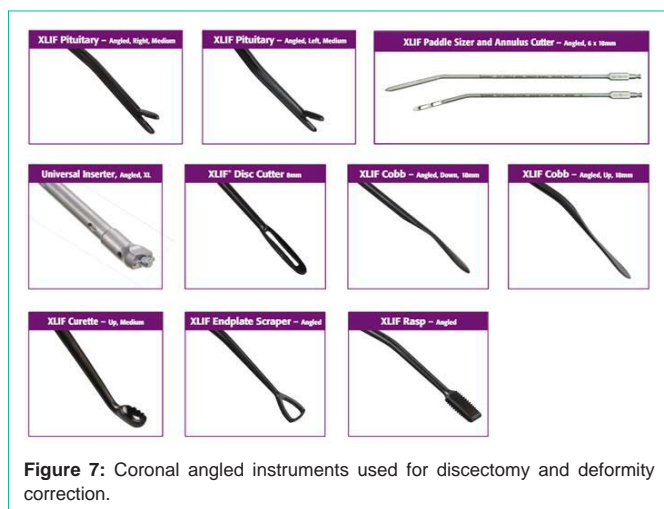
Figure 7: Coronal angled instruments used for discectomy and deformity correction.

slides that protect the endplates and provide a semirigid pathway for the graft to enter the disk space (Figure 3). Once the slides are placed, the interbody graft is attached onto an angled inserted and malletted down in between the slides into the disk space under fluoroscopic guidance. Frequent AP and lateral images are taken to ensure that the graft is entering the disk space and not being placed too anteriorly into the peritoneal space or into the great vessels or too posteriorly into the spinal canal. X-rays also ensure that the graft is not being hammered into the vertebral body endplate. After the interbody graft is in proper position, the slides are removed and repeat radiographs are taken to ensure that the graft has not moved during slide removal.