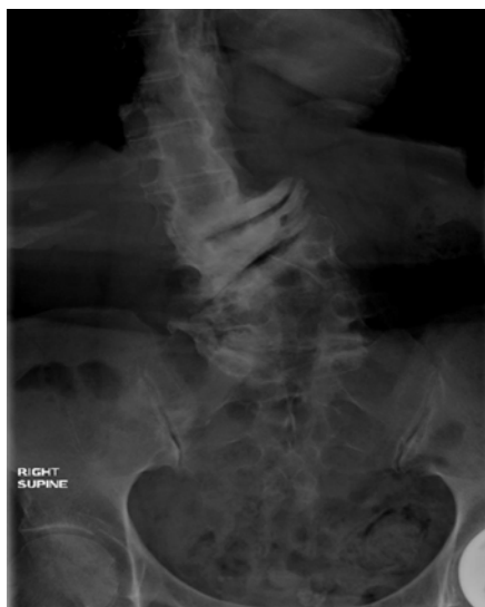
Figure 1: Standing full cassette films of the thoracolumbar spine showing the severe degree of preoperative coronal and rotatory scoliotic deformity.

of instrumentation to gain access safely to correct deformity and gain an adequate fusion. This new technique has been used at our institution for the past three years with excellent results but has not been reported in the literature as of yet.