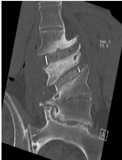
Figure 4: Coronal postoperative CT images with interbody graft in place.