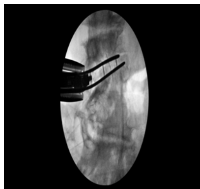
Figure 3: Intraoperative films with slides inserted in preparation for interbody graft placement.

The patient is typically positioned in the lateral decubitus position with the left side up. This is due to the position of the aorta relative to the spine and vena cava. With the aorta on the left side of the spine, it is the structure that is most likely to be injured versus the vena cava. Due to its more muscular nature, the aorta is more amenable to primary repair in the event of inadvertent laceration. Preoperative CT imaging in all patients is critical to making this procedural decision. Another consideration is the apex of the deformity and surgical