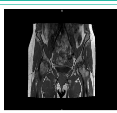
Figure 2: Coronal T2-weighted magnetic resonance imaging of both hips showing collapse of the left femoral head, and a focal area of osteonecrosis in the right femoral head.

Austin J Orthopade & Rheumatol - Volume 2 Issue 2 - 2015 ISSN: 2472-369X | www.austinpublishinggroup.com Wood et al. © All rights are reserved