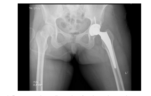
Figure 4: Post-operative radiographs after the patient underwent conversion to an uncemented left total hip arthroplasty.

and knee. It was aggravated with weight bearing with her functional status limited to walking the length of her driveway. Her past medical history was significant for hypothyroidism and bilateral ACL reconstruction. She was taking Synthroid and reported no allergies.