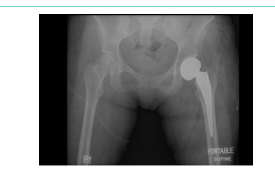
Figure 3: Immediate post-operative radiograph after the patient underwent a left hip hemiarthroplasty.