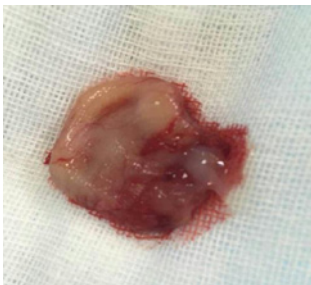
Figure 3: The removed cyst tissue with milky cyst fluid.

The pedicle of the tumor could not be discovered because the tumor had blocked the anterior naris. In addition, CT showed that the density of the nasal anterior mass was homogeneous, because the anterior part of the mass was ductile. Cyst could not be diagnosed until cyst fluid run from the ruptured mass during operation. Enhanced CT or MRI examination preoperatively is recommended to determine the nature of the tumor [2]. The milky liquid is the sufficient evidence for the diagnosis of mucous gland cyst.