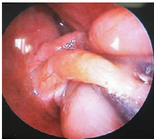
Figure 2: The pedicle of the tumor was found locating in the uncinete process after part of fluid flowed out from the cyst.