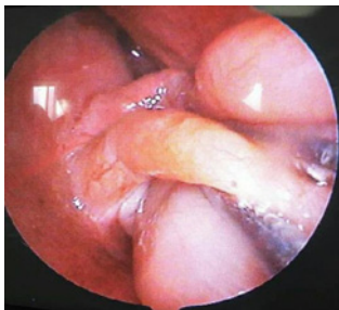
Figure 2: The pedicle of the tumor was found locating in the uncinete process after part of fluid flowed out from the cyst.