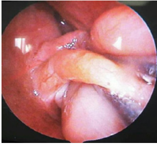
Figure 2: The pedicle of the tumor was found locating in the uncinete process after part of fluid flowed out from the cyst.