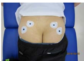
Figure 1: Locations of electrodes for hip extension.

In this phase, the subject under went 2 h of HAL gait training once a week for 1 year (Figure 4). The treadmill speed was adjusted to the patient's condition. The subject could not continue walking with HAL so much after his heart rate reached at 125 bpm. For the safety reason, 125 bpm was set as the discontinuance criteria for the HAL gait training. The treadmill speed and walking distance during the