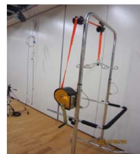
B: Handle for the adjustment of patient height