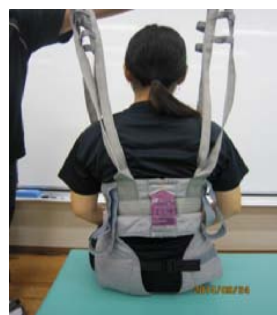
A: The harness for gait training