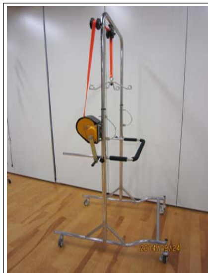
Figure 2: Body-weight supported walker.