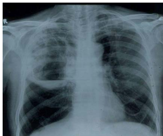
Figure 1: Chest X-ray PA view shows a right sided large abscess with air fluid level at the time of presentation.

within normal limits (SGPT-22IU, SGOT- 30IU, ALK phosphatase – 45IU). Chest X-ray (Figure 1) showed a thick walled cavity involving the right upper and middle zone with air fluid level and surrounding consolidation. A diagnosis of right lung abscess was made and patient started on intravenous antibiotics along with symptomatic treatment. His HIV, HbsAg and HCV were non reactive. Sputum for AFB was negative and sputum for pyogenic culture showed citrobacter and his antibiotics were changed according to the sensitivity report. Patient had relief in his fever, cough and hemoptysis and his chest X-ray (Figure 2) also started showing resolution. But there was no significant improvement in his breathlessness and generalized weakness. Contrast enhanced CT scan of the chest was done when patient remained symptomatic after two weeks of antibiotic therapy. CT scan (Figure 3) revealed pulmonary embolism involving the right main pulmonary artery incompletely occluding the artery. His troponin T was negative, CPK-MB was 92 u/l and serum pro BNP level was 124.7. Echocardiography showed RA/RV dilated with grade 1 diastolic dysfunction. The diagnosis was revised as sub massive pulmonary embolism with infected cavity and he was started on enoxaparin and antibiotics as per his sensitivity reports.