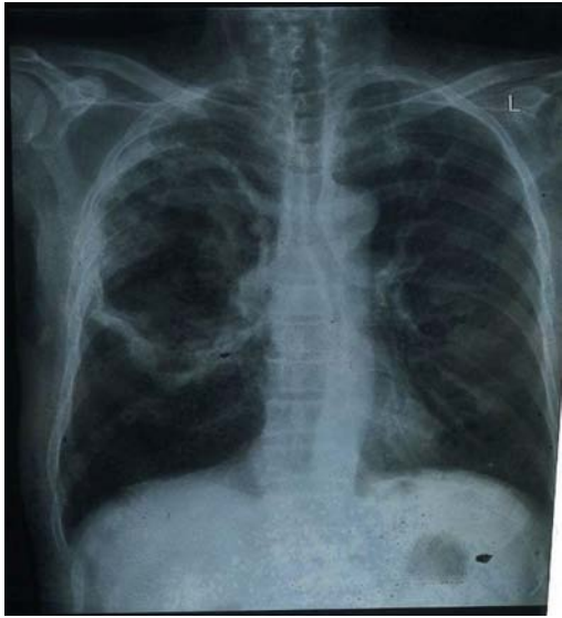
Figure 2: Chest x-ray after 7 days shows resolution with thinning of cavity wall and no air fluid level.