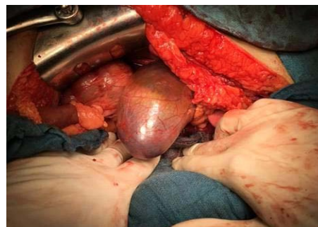
Figure 2: Hydropic gallbladder with diffuse subserosal ecchymosis on the anterior wall consistent of intramural hematoma.

Specific CT findings of traumatic gallbladder injuries involve the gallbladder wall and include: ill-defined contour or discontinuity of the gallbladder wall, active arterial intraluminal extravasation and a