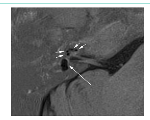
Figure 3: Axial Magnetic Resonance Imaging (MRI) of the affected ear. The affected inner ear shown with 3D real inversion recovery (real IR) MRI. The short arrows indicate significant Endolymphatic Hydrops (EH) in the cochlea, and the long arrow indicates significant EH in the vestibule.

the operation, local anesthesia is a better choice in terms of safety because it allows the surgeon to confirm the patient's hearing and the presence of vertigo. In addition, use of cartilage instead of an artificial stapes may reduce the risk of inner ear damage. Imaging analysis provides useful information for the management of mixed hearing loss. Combined preoperative evaluation with CT and MRI can be beneficial by revealing the state of the middle and inner ear in cases of fluctuating mixed hearing loss.