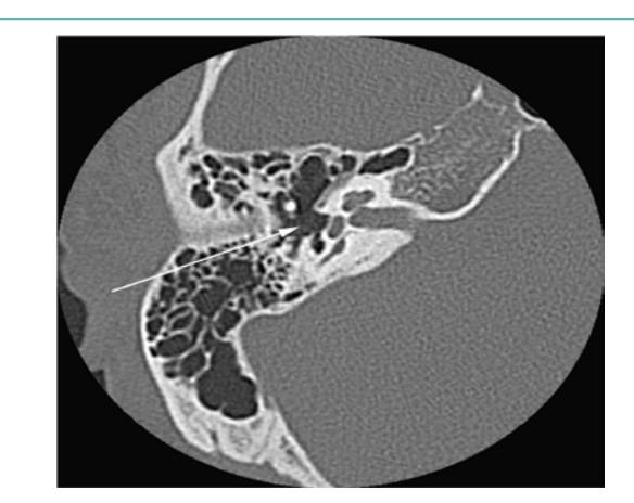
Figure 2: Computed Tomography (CT) of the affected ear. CT image shows the deficit in the stapes of the right ear (arrow).

Our findings suggest that EH should be considered a risk factor for surgical complications after ossiculoplasty, especially in patients with cochlear and/or vestibular symptoms. Not considering such risk factors in these patients can produce unexpected results. The first possible risk involves damage to the endolymphatic space against the stapes footplate. Preoperative differentiation of the presence or absence of EH is essential to the hearing outcome. The results of histological examination showing otosclerosis in combination with Meniere's disease suggest that a stapedectomy can cause severe inner ear hearing loss if saccule is in contact with the inner surface of the stapes footplate [6]. According to the report by Issa et al. [6], stapedectomy does not increase the risk of sensorineural hearing loss in patients with otosclerosis and Meniere's disease who have bone conduction levels of 35 dB or better at 500 Hz and no high tone loss. Second, ossicular reconstruction can cause inadequate hearing recovery or unexpected sound-induced vertigo. When we perform