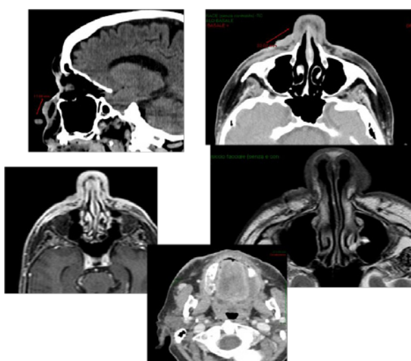
Figure 2: TC and RMN on April 2015. There is a thickening of the skin plans of the right naso-labial fold of about 23mm with shoots of infiltration in the subcutaneous adipose tissue, in the ala of the nose muscle with involvement of the angular artery of the nose, with no signs of erosion of bone surfaces. It is also showed a diffuse thickening of the dermis of the zygomatic-orbital area adjacent to the lesion, partially infiltrative.