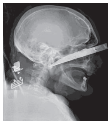
Figure 2: Lateral view on X-ray showing a penetrating knife.