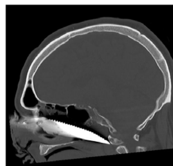
Figure 3: Lateral view on cerebral CT.