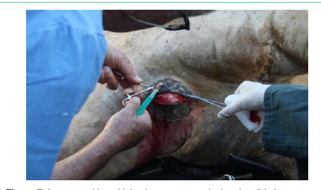
Figure 7: In cases with multiple abscesses, surgical and antibiotic treatments are recommended.

In small ruminants, animals with enlarged lymph nodes are culled. This procedure is not practical with camelids. Corynebacteria are very sensitive to penicillin, tetracyclines and cephalosporines but the fibrous capsule and the pus in the abscess prevents the medication from reaching the bacteria. Antimicrobial treatment is often not rewarding and other treatment methods should be considered. Since erythromycin is more able to penetrate tissues, Bergin [35] proposed a combination of penicillin and erythromycin to treat pseudotuberculosis in camels. Other possibilities of treating CLA in camels is the intravenous injection of 20ml of Dimethyl Sulfoxide (DMSO) in combination with 20-25ml of Baytril for 12 days or intravenous injection of 20% sodium iodine in 500 ml NaCl as a single treatment which can be repeated 2 to 3 weeks later. The abscesses may eventually subside with no relapse. Purohit et al. [6] used corticosteroids and systemic antibiotics with little success and therefore injected intramuscularly a Lugol's solution for 5 days with the following doses: 100ml, 100ml, 90ml, 80ml and 70ml. Samartsev [12] applied with good success 2 to 5% creolin and iodine lotions topically. However, in cases with multiple abscesses, surgical and antibiotic treatments are recommended (Figure 7).