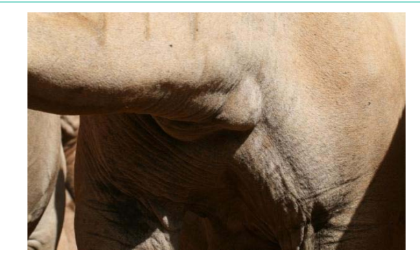
Figure 2: Pathognomonic in camels are cold, closed painless abscesses up to the size of a lemon or orange in the external lymph nodes.