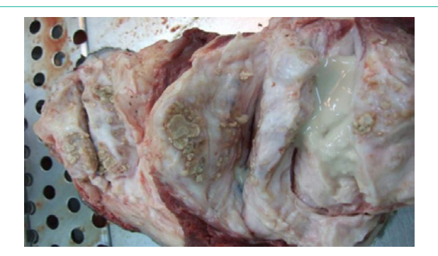
Figure 4: Large central abscess with multiple small abscesses in the peripheral connective tissue capsule.