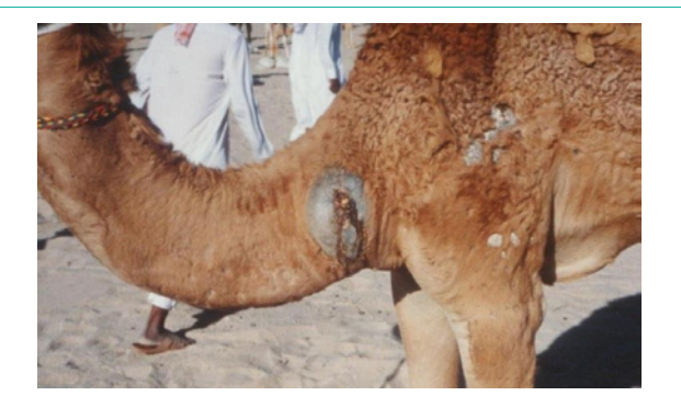
Figure 8: Development of granulomas of different sizes at the injection site.

Vaccines against CLA for sheep and goats are commercially available, but are not licensed in countries in which they are not produced. Therefore, for their use in NWCs for example a special permit is needed. Additionally, sheep and goat lymphadenitis vaccines are not used in camels because the protective doses are not adopted for camels. Therefore, they are not available for camelids. These commercial vaccines do not provide complete protection against the development of abscess formation but a significant reduction in the number of abscesses. The vaccines are formulated from concentrated formalin - inactivated C. pseudotuberculosis culture supernatant containing PLD, ultra-filtrated C. pseudotuberculosis antigens; Clostridium perfringens type D and C and Cl. tetani. Attenuated mutant vaccines are also available. One of the formalin-inactivated vaccines has been used in dromedaries during a trial vaccination but had to be abandoned due to the development of granulomas of different sizes at the injection site (Figure 8).