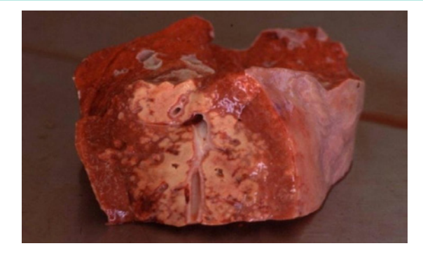
Figure 6: Abscess breaks through the ribs and the organisms enter the lung producing severe bronchopneumonia with pulmonary caverns.

In several European countries with increasing number of camelids, a program exists to test all NWCs regularly on a voluntary basis for antibodies to CLA. During these investigations it was observed that more than 40% of tested NWCs in some areas showed antibodies to