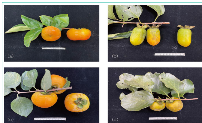
Figure 1: Four types of Diospyros kaki cultivars based on fruit classification. (a) Diospyros kaki cv. Fuyu, PCNA type. Fruit will be sweet whether hard or soft (b) Diospyros kaki cv. Fudegaki, PVNA. Unseeded fruit must soften after harvest to be sweet (c) Diospyros kaki cv. Hirataneanshi, PVA. Fruit remains astringent, except near seeds. (d) Diospyros kaki cv. Bull Heart, PCA. Fruit must become soft to be edible.