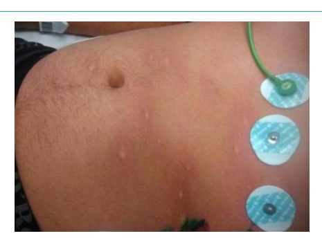
Figure 1: Skin lesions in abdomen.

A new blood test showed 21.000 leucocytes and the creatinine was elevated at 1, 6 mg/dl. The increase of leukocytes and the elevation of creatinine were considered as an adverse reaction to RCM.