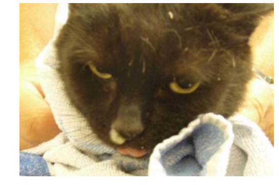
Figure 1: Unilateral purulent nasal discharge.

Up to 30% of cats with chronic nasal discharge suffer from