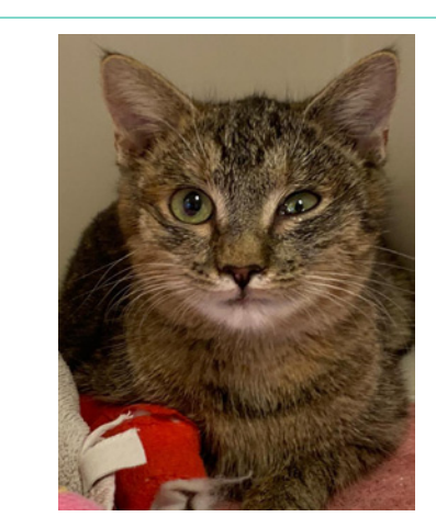
Figure 7: Tranient Horner syndrome after removal of a nasopharyngeal polyp in a cat.

prevalence in healthy cats (Figure 7). Cytology of nasal is usually unspecific, but fungal organisms or neoplastic cells may be found. Bacterial culture of nasal discharge is of no value as it commonly yields a mixed growth of normal commensal microflora. Culture and sensitivity of nasal flushes or nasal biopsies resemble the mucosal bacterial infiltration more closely but the majority of the spectrum of microorganisms observed in cats with chronic rhinitis can also be identified in healthy cats. The role of Mycoplasma spp. in feline chronic rhinitis is under debate.