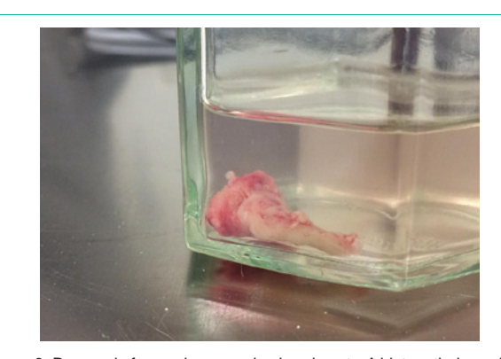
Figure 6: Removal of nasopharyngeal polyps in cats. A histopathology should always be performed to secure the diagnosis.