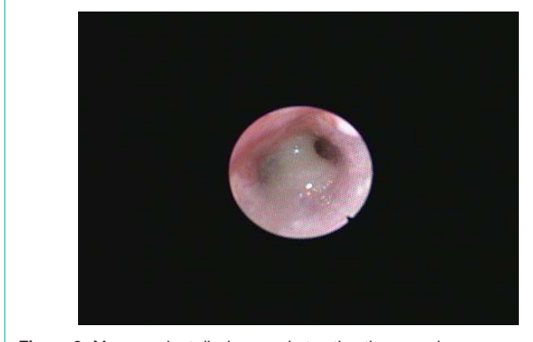
Figure 3: Mucupurulent discharge, obstructing the nasopharynx.