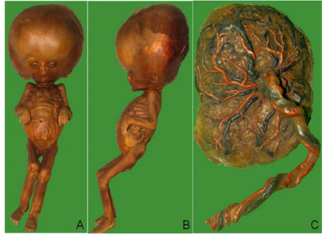
Figure 4A,B: This is a hydrocephalus in a 1 year old female infant, the body was embedded in paraffin. Preparation was made in 1948.