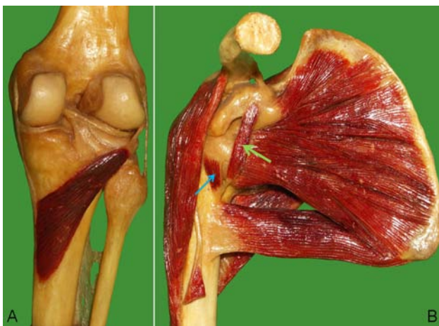
Figure 1A: The knee joint: posterior view with the popliteus muscle. Ligaments and menisci are visible.

The specimens were prepared and kept differently, according mostly to the aims of anatomy teaching. In the "Albert Gellért Anatomical Collection" we have syndesmology specimens: the bones, the ligaments, the articular capsule and related structures are shown (Figure 1). We have a large number of myology specimens, where muscles and muscle groups (with skeletal elements) are visible