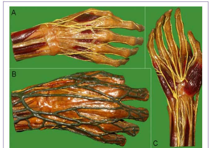
Figure2A: Dorsal branch of the ulnar nerve and the superficial branch of the radial nerve with dorsal digital branches are yellow. The dorsal carpal tendons, the dorsal interossei (brown colour) and the extensor retinaculum are visible, too.