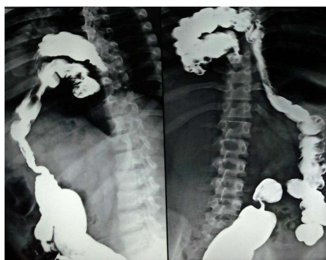
Figure 1: Barium enema lateral view and anterior view, showing transverse colon, ascending colon and caecum at high position on Right side of abdomen with anterior diaphragmatic hernia.

was secured with 6.0mm cuffed endotracheal tube. Anesthesia was maintained with oxygen (FiO 2 -0.4), air and desflurane (MAC 1.2%) and positive end expiratory pressure of 4 mmHg was added to adjust normocapnia. Intravenous paracetamol 15mg.kg -1 , fentanyl 30µg, ondansetron 4mg and intermittent boluses of vecuronium were administered intraoperatively. Continuous Invasive BP (120/60-100/68 mmHg) and EtCO 2 (35-40 mmHg) were monitored along with intraperitoneal insufflation pressure which were kept between 9-10mmHg. Intraoperative ABG was normal. Surgery included the insertion of a 10 mm umbilical and two 5 mm working ports on both sides of the midline in the upper abdomen. Hernial contents, i.e. transverse colon and a very heavy fat laden omentum were easily reduced. The sac was excised using ultrasonic scalpel without injuring pleura or pericardium. Due to obesity and the thickness of the abdominal wall intracorporeal tissue approximation of defect failed. It was closed by passing conventional 2 inch needle threaded with double 0 silk through the abdominal wall lower lip of defect, and then