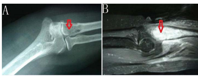
Figure 1: A) Plain radiographs of the right elbow revealed that right proximal ulna destruction were irregular because a little periosteal reaction side of the rim no obvious narrow joint space. B) Images enhanced markedly after contrast-enhanced scanning. The lesion extended beyond the cortical margins of the bone and went into the adjacent muscle.

characterized as painless, massive cervical lymphadenopathy which affects all age groups including pediatric patients [2]. There is a slight predilection in male and African Americans that they are more likely to be affected. The commonest presentation of RDD is painless cervical lymphadenopathy. However, other nodal sites may be involved. In the order of frequency, the sites are cervical, axillary, inguinal, paraaortic, and mediastinal lymph nodes. Approximately 90% of patients will have painless lymphadenopathy in the cervical region. 43% of the patients suffer from extra-nodal disease and only 23% suffer from extra-nodal disease without identified nodal involvement [3]. Rare extranodal sites include the soft tissue, skin, upper respiratory tract, gastrointestinal tract, breast, bones, and the central nervous system. In the 423 RDD cases presented by Foucar et al, 7.2% of cases had osseous involvement without lymphadenopathy, and 0.5% of them had isolated osseous involvement [3]. However, constitutional signs and symptoms might be evidences, such as fever, weight loss, leukocytosis and neutrophilia. Signs and symptoms of the disease are usually various according to the affected sites. RDD is easily misdiagnosed due to the clinical symptoms, rarity, and lack of understanding of this disease. The clinical symptom of the case reported here was some pain in right elbow without any fever and other medical problems.