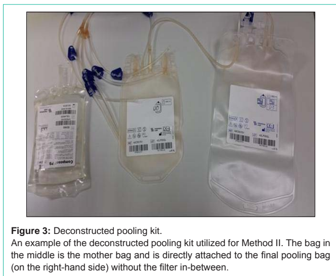
Figure 3: Deconstructed pooling kit. An example of the deconstructed pooling kit utilized for Method II. The bag in the middle is the mother bag and is directly attached to the final pooling bag (on the right-hand side) without the filter in-between.