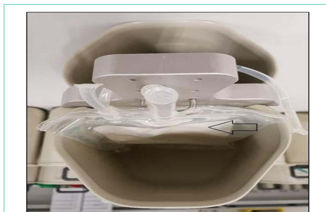
Figure 2: The support. A support (indicated by the arrow) was added to the centrifuge insert. This enabled the unit and its components to keep steady throughout the centrifugation process.

The Platelet Count per unit ( \times 10^{11}/L ) and Volume per 60 \times 10^9 platelets (ml) of the final RP obtained from the four different methods, as well as the conventional pooling of platelets (using five BCs) performed at the NBTS, were statistically analyzed by the OneWay Analysis of Variance (ANOVA) test using the IBM SPSS Statistics 20 Software. Raw data has been summarized in Descriptive Data Tables 1 and 2. Tukey Post Hoc test was used to compare mean platelet counts and mean volume between several methods,