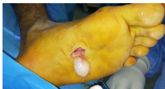
Figure 2: Intra operative appearance showing a whitish tumor formation at the plantar level.