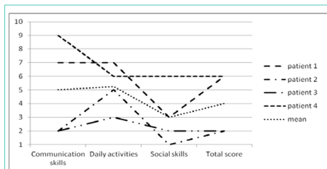
Figure 1: Results on the Vineland Adaptive Behavior Scale. These scores are decile scores, which means that a decile score of 1 (Y-axis) corresponds to the 10% lowest scoring persons and a decile score of 10 (Y-axis) corresponds to the 10% highest scoring persons. These scores are standardized for people with a severe intellectual disability.

The data are presented in the next section, subdivided into